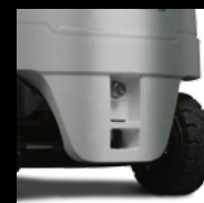
performance silver (only available in the UK)

TCM offers a broad range of options for maximum customisation. Please ask your dealer.