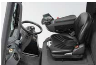
Comfort and productivity promoting workplace